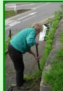
June weed clearing at The Cloud